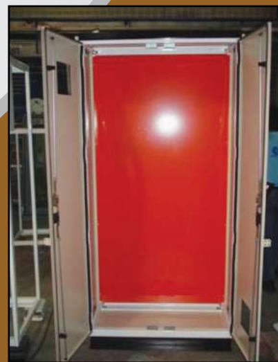
VMS - FINAL ASSEMBLY