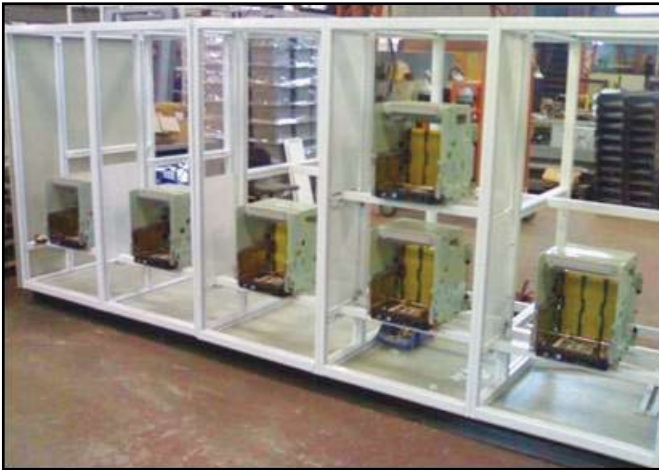
VMS STRUCTURE WITH COMPONENTS