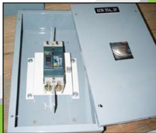
Enclosed Circuit Breaker