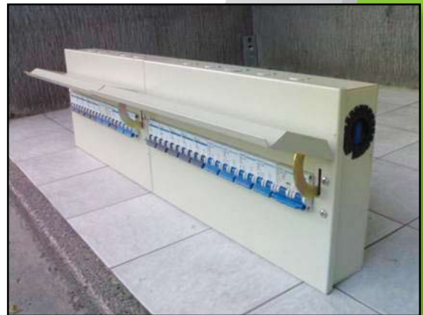
Load Center (6 - 12 branches)