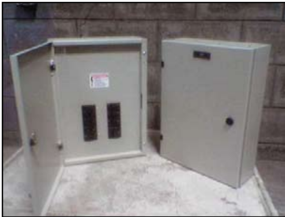
Panelboards (6 - 48 ways)