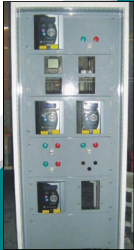
Control and Protection Panel